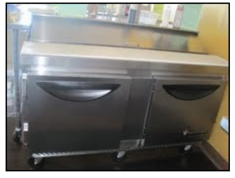
Victory sandwich table